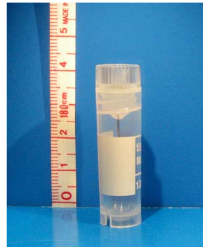
The VitroLoop™ storage container is pictured above. Units are in cm.

The second storage container is called a CryoLock, and is also considered an “open system”. This system is composed of a two piece straw. The main piece consists of a handle portion with a very small angled well on one end. The second piece consist of a “cap” that covers and “locks” over the angled well end of the straw. The oocytes are loaded onto the angled well and the straw is then plunged into liquid nitrogen. The angled well containing the oocytes is then covered with the cap while remaining under liquid nitrogen. This combined unit is then transferred into larger containers for long-term storage. It is truly uncertain which storage unit works best.